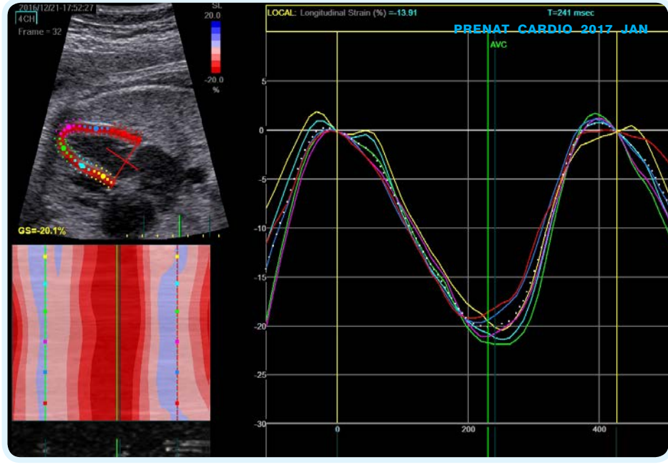
Fig. 3. Deformation study using 2D speckle tracking.

Pulsed-wave tissue Doppler interrogation of the right ventricle. S´ - peak annular velocity in systole; E´ - peak velocity in early diastole; A' - peak velocity in late diastole during atrial contraction.