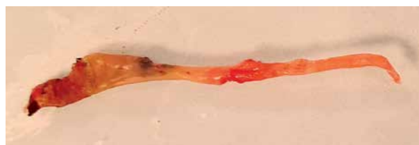
Fig. 2. Laser stripping

Both 1470 nm and 1940 nm laser technology, together with radial fibres, are characterized by the low rate of the periprocedural complications, including mostly postop-