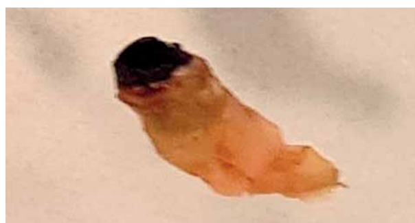
Fig. 3. Anterior accessory saphenous vein

erative neurological and thrombotic (EHIT, superficial thrombosis, DVT) episodes. To the best of our knowledge, laser fibre stripping has not been reported in the comprehensive literature of EVLA series. Despite years of experience with laser technology of various wavelengths, this was the first case of such complication also in our centre. In the available literature one case of vein stripping when using an MOCA device has been described by British authors, but up to now, no laser probe and endovenous laser-related stripping can be found [13].