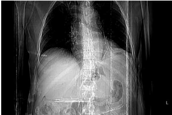
Figure 2. Radiological control of stent position