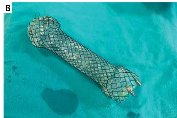
Figure 3. Removal of stent: A – endoscopic view of anastomosis, B – view of the anchored clips over the stent