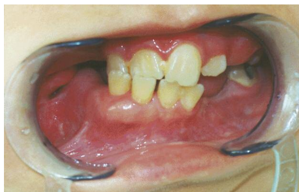
Fig. 2. Intraoral photograph of the patient

6 years old), the tumour kept recurring. The patient received orthodontic treatment of the co-existing malocclusion which was to prevent further mandible movement towards the right-hand side of the face – a Metzelder appliance (removable orthodontic appliance for the upper and lower jaw) was used. Once placed in the mouth, this functional appliance forced proper placement of the mandible versus the maxilla. The proper spatial relation between the mandible and maxilla was specified and recorded with a construction bite. The treatment lasted 3 years, yet although the appliance was used conscientiously by the patient, no significant clinical improvement was identified.