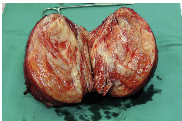
Fig. 2. Dissection of the tumor

radically or in association with familial adenomatous polyposis (FAP) (e.g. Gardner's syndrome variant of FAP). The other predisposing factors are pregnancy, previous abdominal surgery or trauma, and estrogen therapy [1, 2, 5, 7, 8]. It is a rare clinical entity; the estimated incidence is 3.7 new cases per million people per year [1, 2]. The incidence of abdominal wall and mesenteric desmoids in patients with Gardner's syndrome ranges from 4 to 29% [2].