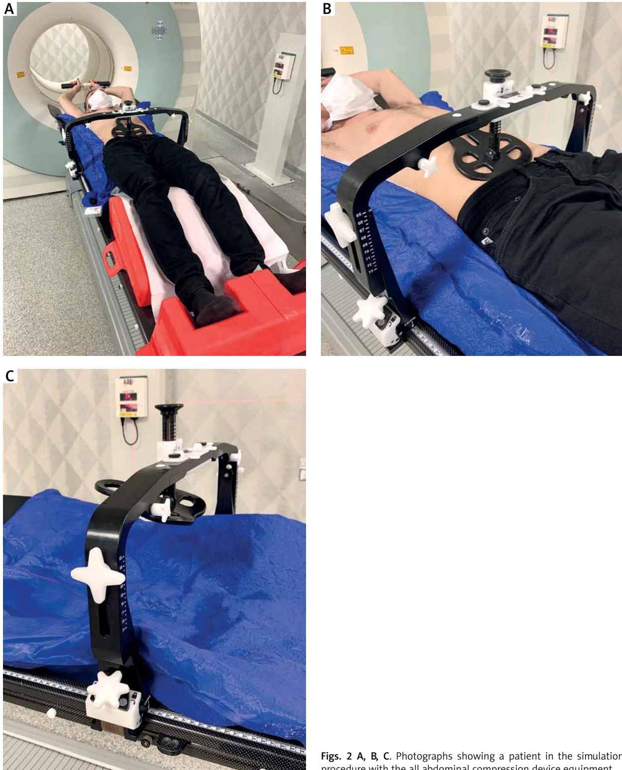
Figs. 2 A, B, C. Photographs showing a patient in the simulation procedure with the all abdominal compression device equipment

There are many modern technical options in liver SBRT applications. Abdominal compression technique was the most appropriate approach for our clinic in terms of cost, infrastructure and the possibilities offered. In the SBRT application with the AC technique, pressure on the abdominal region is applied to restrict the movements of the diaphragm, thus restricting the abdominal breathing and encouraging lung-based superficial breathing. Therefore,