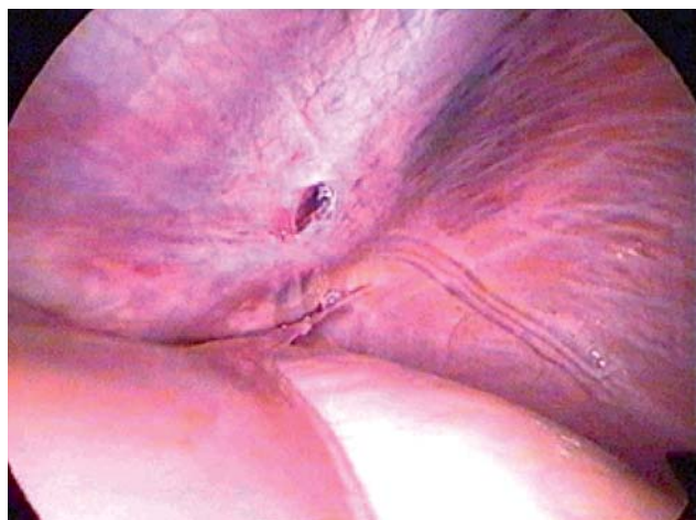
Fig. 1. Injury of the diaphragmatic dome presented through the thoracoscope

A 40-year old female, with a bullet wound of the left side of the chest, presenting with marked paleness of skin and cyanosis of lips, was admitted to the unit. The onset time of damage was no more than 1.5 hours earlier. The condition of the patient was unstable with arterial blood pressure 60/40 mm Hg, weak filling pulse and heart rate 120-130 per minute but consciousness was kept. The air entry at the left side was reduced. The blood was free aspirated by thoracocentesis on the left midaxillary line in the 4 th intercostal