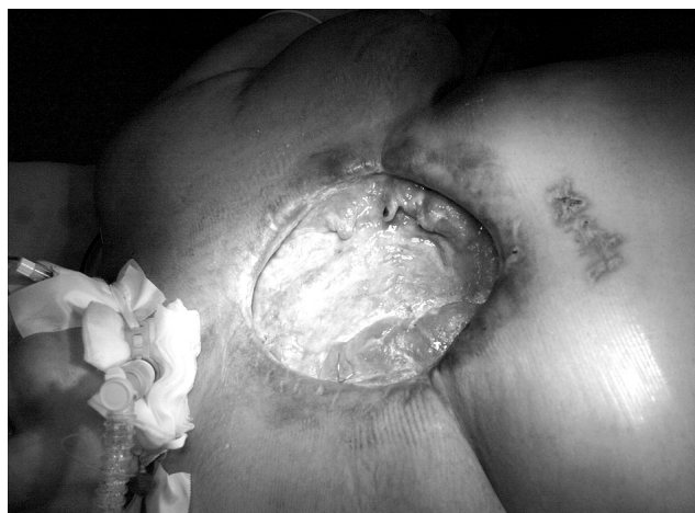
Fig. 1. The wound around three months after the first surgery

Figure 1 shows the wound around three months after the first surgery. In the mid chest between the breasts, at the level of the body and xiphoid process of the sternum, round wound can be seen, approximately 20 cm in diameter, surrounded by a thick cicatricial band with traces of the removed sutures. The wound bed is covered with reddish-pink granulation tissue, yellowish-green fibrin and serous effusion. In the right part of the wound cicatrized pectoralis major muscle is visible. In the bottom and top areas of the wound, pouches with serous effusion are shown.