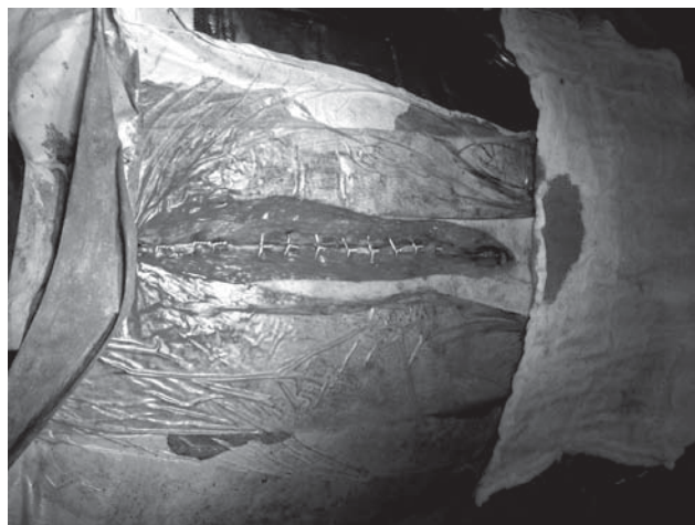
Fig. 3. Sternal fixation with higher number of single wires

There are some concerns that the dipping of GMCS in saline for a few seconds prior to application may lead to the leaching of gentamicin from the sponge into the saline, which in turn may reduce efficacy. As a result we have changed our approach and we currently implant dry GMCS