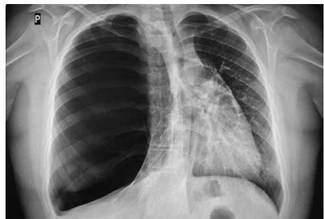
Figure 1. Initial X-ray of the chest: increased translucency of the right hemithorax with leftward shift of the mediastinum

and personal pathological history included few upper airway infection episodes, which were treated by the family doctor with symptomatic drugs. Physical examination revealed distended chest with minimal movements on the right side, hushed breathing sounds over the right lung, and oxygen saturation of 88%. The boy was sent for radiological examination. X-ray of the chest showed increased translucency of the right hemithorax with leftward shift of the mediastinum (Figure 1), and was interpreted as right-sided pneumothorax. The boy was immediately admitted to a regional hospital, and underwent chest drainage. The drain was placed in the second intercostal space, right midclavicular line; nevertheless the symptoms did not improve, and the air leak was not observed in the drainage system. The general state of the patient was worsening. The boy was transported to the clinical hospital, where the first drain was removed, and the second drain was inserted in the fifth intercostal space in the right mid axillary line, and suction was applied. This time, constant leakage of air in the drainage system was observed, the general state of the patient rapidly improved, and the symptoms resolved. Closer examination of the first and follow-up X-rays of the chest brought the suspicion of congenital lobar emphysema of the right upper lobe. The CT of the chest showed