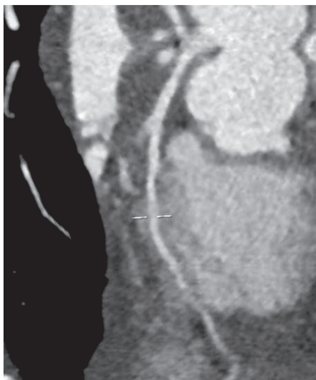
Figure 2. LAD middle segment long segment deep myocardial bridging

Myocardial bridging was divided into two types: ‘deep’ and ‘superficial’. Deep myocardial bridging was identified as full LAD (depth ≥ 2 mm) (Figure 2) surrounded by myocardium. Superficial bridging was defined as the surface not completely covered by myocardial fibers (depth < 2 mm) (Figure 3) [13, 14]. Location of the LAD (proximal, middle, and distal) MB segment was saved. The length and depth of the bridging segment were calculated with the digital caliper on the curved MPR. The diameter of each bridging segment was measured at the end of the diastolic and systole phase in curved MPR. The systolic compression difference and percentage were calculated from the average of the measurements in two different phases. For each bridged segment, the presence of atherosclerosis was