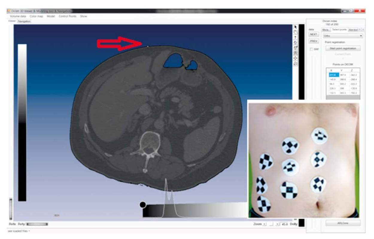
Photo 1. Patient with attached markers (right), which are visible in CT image (left) – with 9 markers attached to the patient

moment of time in tracker coordinate system, N_s – number of markers, Rotj , Transj – Horn rotation and translation at the j -th moment of time.