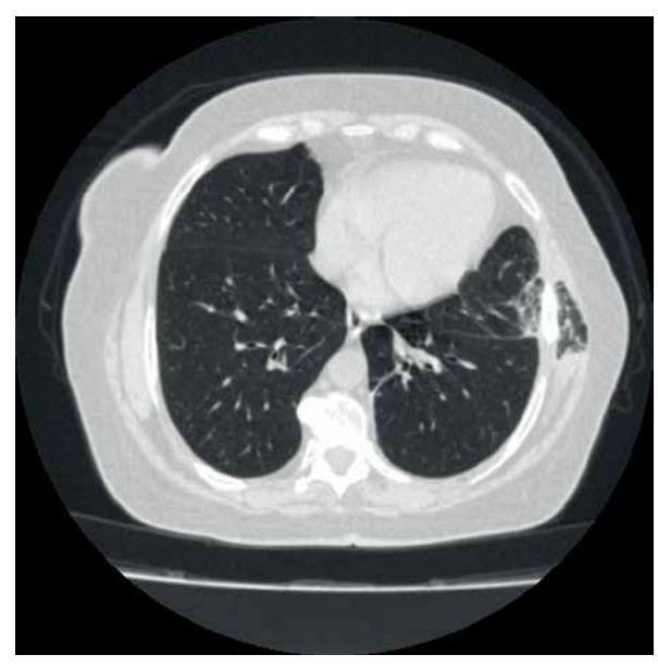
Photo 1. Chest CT revealed protrusion of a small part of left lower lobe through the 7<sup>th</sup> intercostal space

The aim of this study is to evaluate risk factors of lung herniation after VATS resection and to define some recommendations for preventing this complication.