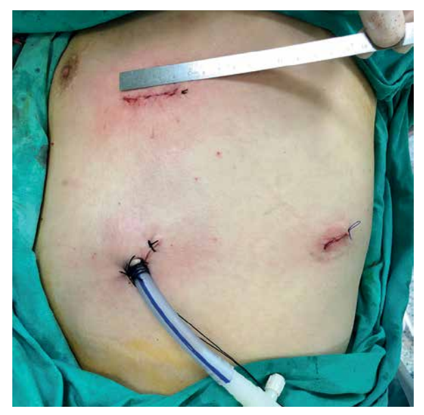
Photo 4. This image belongs to a patient who has undergone VATS lobectomy. We usually make the utility" incision (3 to 6 cm) in the anterior axillary line, about 5<sup>th</sup> intercostal space

In these cases, polytetrafluoroethylene and Gore-Tex patches were used depending on the surgeon's personal preference. There was no recurrence in the follow-up period and all patients of this series recovered uneventfully (Table I).