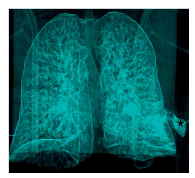
Photo 5. Three-dimensional volume rendering of CT data can provide additional benefit to the visualization of the herniated parenchyma (asterix)

incision (3 to 6 cm) is usually placed in the anterior axillary line, about the 5th intercostal space [11]. For convenience purposes, many surgeons prefer to make a longer incision under the skin especially in the intercostal space. These factors, which are specific to the VATS procedure, contribute additional risk to lung herniation. For lung herniation some predisposing factors are defined in the literature: activities that increase intrathoracic pressure such as cough and heavy lifting, chronic obstructive pulmonary disease, inflammatory or neoplastic processes and chronic steroid usage [12].