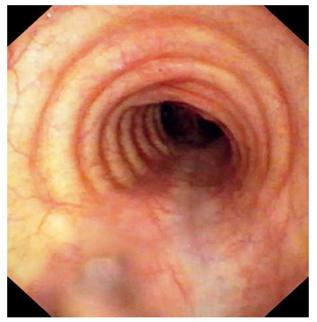
Photo 2. An endoscopic view of a thin epithelialized postoperative scar on the membranous tracheal wall after 23 months in patient 3