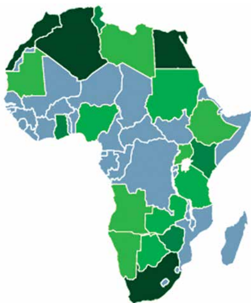
Fig. 1. Brachytherapy availability in Africa. Varying shades of green show the availability and density of brachytherapy units in countries where they are available. Blue color shows where there are no brachytherapy units

Cervical cancer incidence and total number of brachytherapy units vary significantly across the continent, with the former being significantly higher than the lat-