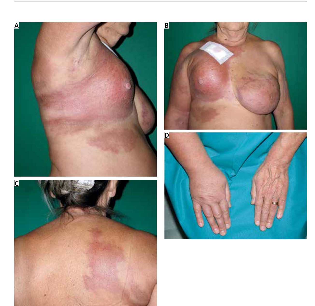
Figure 1. (A) Extensive, prominently indurated skin infiltration covering the entire range of the markedly retracted right mammary gland and (B, C) extending to the adjacent area of the chest, right arm and upper back; (D) lymphedema of the right upper extremity

Breast cancer is also the most common source of metastases to skin in females accounting for 69% of all CMs cases followed by colon cancer, malignant melanoma, and ovarian/cervical cancers [8, 9]. In approximately 12% of patients the origin of CMs remains unknown [10]. Cutaneous metastases are the initial sign of BC in about 37% of men and 6% of women [8]. A recent large metanalysis revealed that overall frequency of CMs is 5.3% [6]. The time between diagnosis of BC and resultant CMs