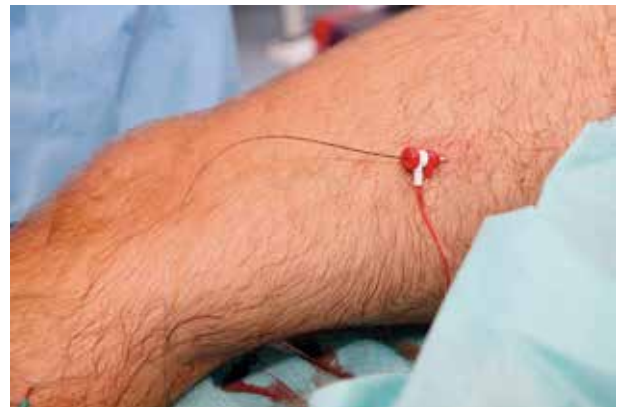
Fig. 1. Access via 4F sheath introducer

In all patients the procedure resulted in complete occlusion of the incompetent segment of the GSV or SSV (Table 1). After 12 months partial or complete recanalisation was