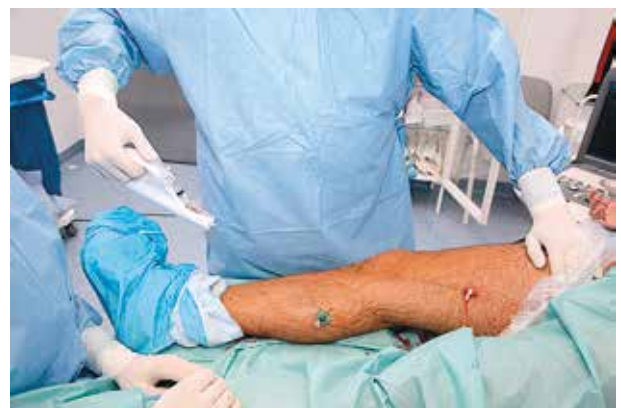
Fig. 2. With active tip rotation the catheter is retrieved with simultaneous polidocanol administration