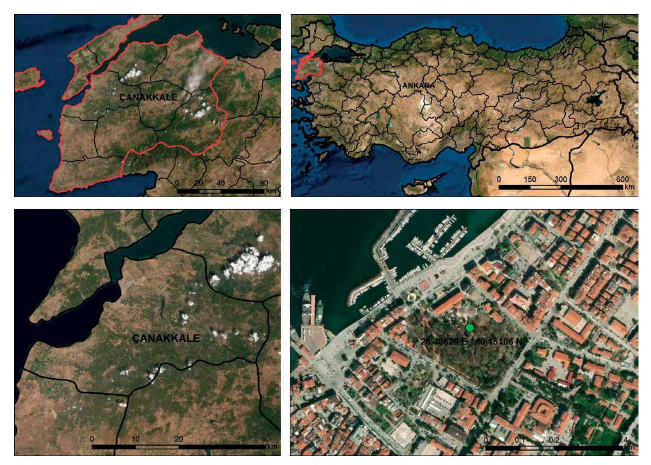
FIGURE 1. The location map of the study area

inverse correlation between the amount of two invasive pollen distribution and the seasons. The highest amount of Ambrosia sp.'s pollen was found in August. In contrast, Ailanthus sp. pollen reached its highest level in spring while the lowest level was determined in summer time (Figure 1).