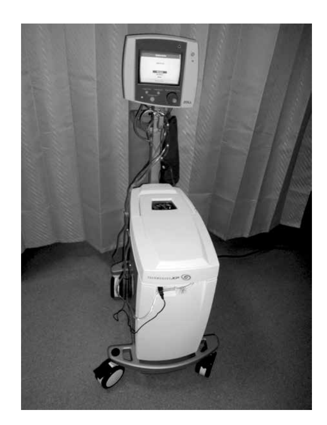
Figure 1. The Alsius Coolgard 3000 cooling device

This device consists of a temperature control system comprising as follows: temperature probes; an intravascular heat exchange catheter; a disposable tubing pack to connect the temperature control system; and a catheter (Fig. 1). The system circulates sterile saline in a closed loop to the balloons on the central venous catheter. The catheter has two lumens for circulation of the cooled saline and a third standard lumen (Fig. 2). The blood is cooled as it passes the membranes. The core temperature is continuously monitored via a urine catheter probe and any change results in feedback to the machine which, in turn, regulates the temperature of the saline. The operator sets the target temperature and rate of cooling.