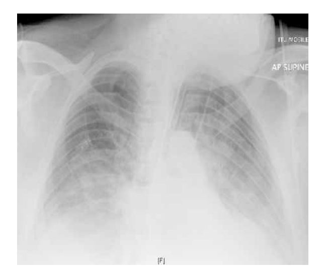
Figure 1. Chest X Ray of patient 1 in the previous 24 hrs prior to ECMO initiation