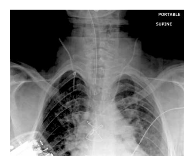
Figure 2. Chest X-Ray with the knotted PAC in situ

duced to a depth of approximately 50 cm. At this point, the pressure curve of the pulmonary artery was identified. The balloon was subsequently deflated and the catheter kept in position for hemodynamic measurements. During the repair of the congenital cardiac lesion, the catheter was withdrawn into the superior vena cava (SVC) until central venous pressure tracing was confirmed on the distal port of the catheter.