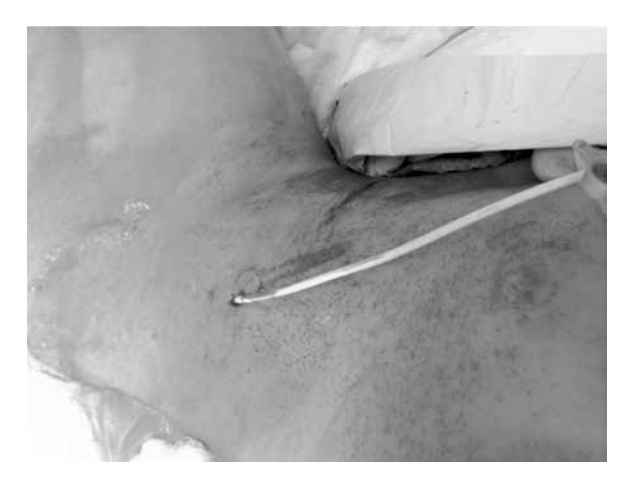
Figure 1. Patient's head on the right side: Cordis sheath at this stage removed, knotted PAC stuck at 10 cm at skin level