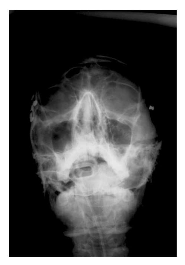
Figure 1. Head X-ray showing pellets in the skull

At the beginning of the hospitalization period the patient required administration of norepinephrine (2–4 \mu g min<sup>-1</sup>) and dopamine (2 \mu g kg<sup>-1</sup> min<sup>-1</sup>) to maintain a mean ar-