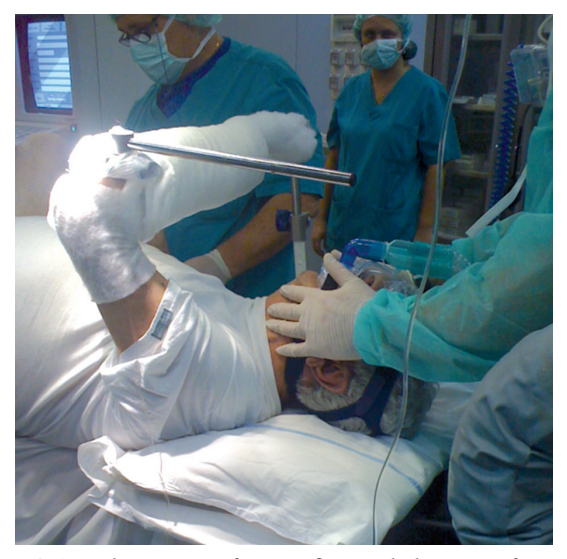
FIGURE 5. The same case of previous figure at the beginning of surqery

at-risk, compromised patients, and resulting in resource sparing compared to GA. However, the limitations and the adverse events of a non-invasive respiratory approach during surgery under NA should be carefully considered, together with the possibility to quickly convert NIV to invasive ventilation.