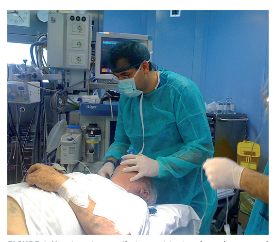
FIGURE 4. Non-invasive ventilation positioning through oro-nasal mask during the preparation of surgical field for femoral osteosynthesis in an elderly obese chronic obstructive pulmonary disease patient