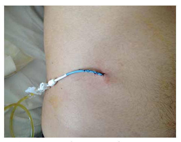
Figure 2. External appearance after percutaneous cholecystostomy

In the absence of symptoms related to a complication, under general anaesthesia, the four-cannula tech-