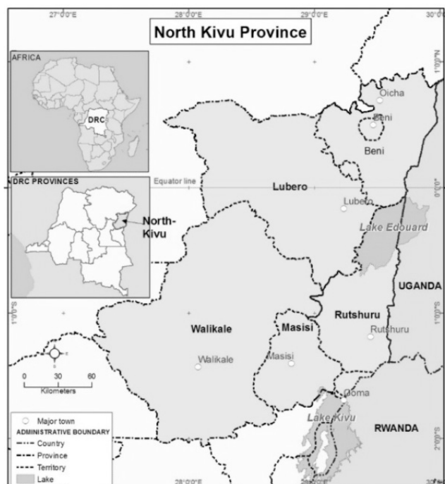
Figure 1. North Kivu [3]

North Kivu (Figure 1) is the epicentre of the Kivu Conflict where armed conflict between the military of the Democratic Republic of the Congo (Armed Forces of the Democratic Republic of the Congo – FARDC) and the Hutu Power group has resulted in violent armed clashes and inter-communal conflict [1]. With a 21,000-strong force, United Nations Organization Mission in the Democratic Republic of the Congo (MONUSCO) constitutes the largest peacekeeping force currently in operation. This area has about one million uprooted people and shares its borders with Uganda and Rwanda, with cross border movement for trade. The humanitarian crisis and deterioration of the security situation of this nature is expected to affect any response to the outbreak [2].