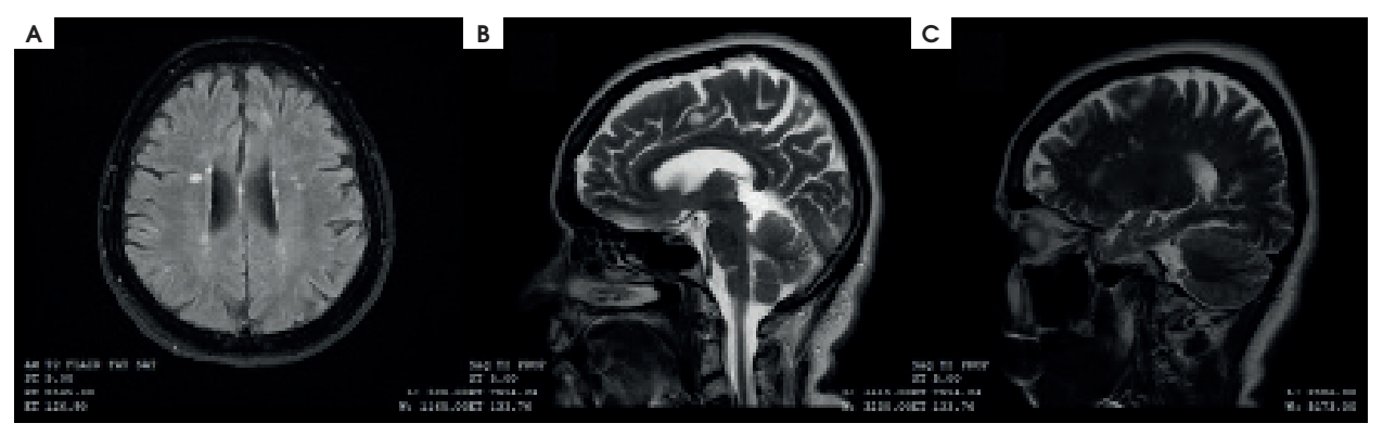
Figure I. A) Magnetic resonance imaging (MRI) scan of the brain in T2-weighted image in FLAIR sequence, (B) axial plane, (C) MRI scans of the brain in T2-weighted image, sagittal plane. Multiple sclerosis lesions according to Barkhof and Tintoré MRI criteria for primary progressive multiple sclerosis (14)