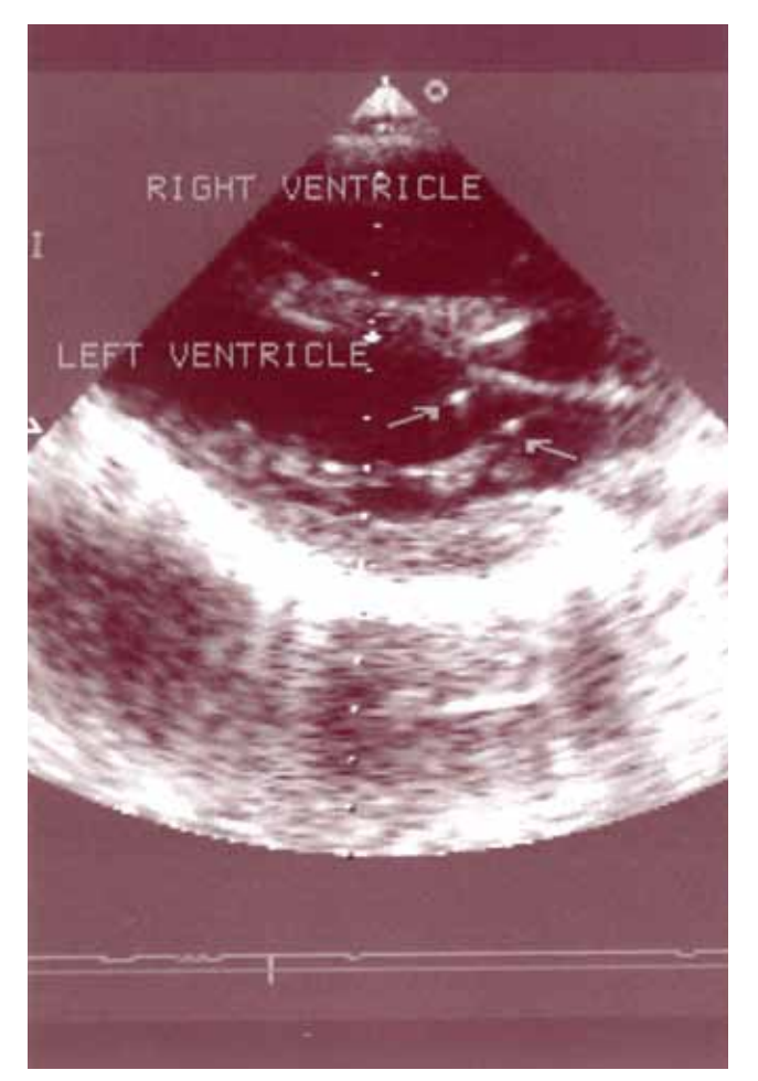
Fig. 2. Echocardiogram. Gas bubbles in the left ventricle (arrows)

Interestingly, 13.9% claim that they remove the catheter when the patient is placed in a reclining position [2].