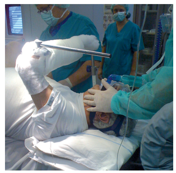
FIGURE 4. The same case of previous figure at the beginning of surgery

at-risk, compromised patients, and resulting in resource sparing compared to GA. However, the limitations and the adverse events of a non-invasive respiratory approach during surgery under NA should be carefully considered, together with the possibility to quickly convert NIV to invasive ventilation.