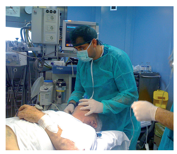
FIGURE 3. Non-invasive ventilation positioning through oro-nasal mask during the preparation of surgical field for femoral osteo-synthesis in an elderly obese chronic obstructive pulmonary disease patient