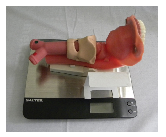
Figure 1. Upper airway model used in the study

A total of 206 anaesthetists and anaesthetic nurses employed in seven Warsaw-area hospitals participated in the study. A general outline of the participants is shown in Table 1.