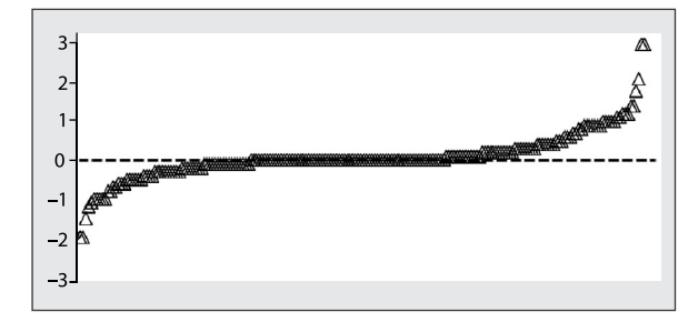
Figure 3. Variability of force (kg) between first and second attempts of cricoid pressure.

Each triangle ( \Delta ) represents a difference in force (in kg) between the first and second attempt of cricoid pressure for each subject (for example, a triangle at level –2 represents a difference of –2 kg (20 N) between two attempts which means that the force of the second attempt was 2 kg stronger than in the first