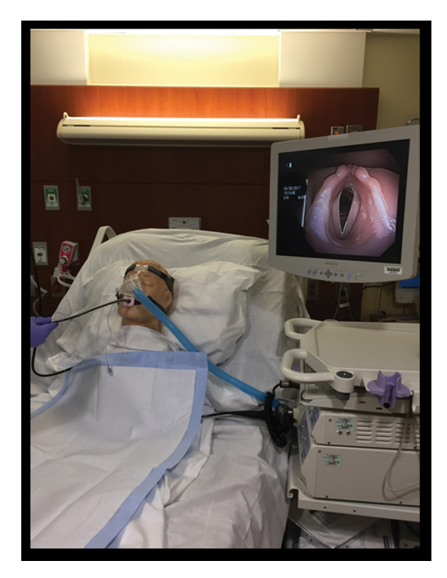
Figure 2. Demonstration of the concept of awake bronchoscopic intubation supported with continuous nasal positive pressure ventilation

Airway management plans can be more complex with the application of NIV and require additional experience with a defined protocol. The equipment costs include the use of the ventilator, the disposable airway interface, ventilator tubing, and the personnel to set up the equipment. Adding unfamiliar equipment and procedures can distract clinicians during emergency airway management. Using