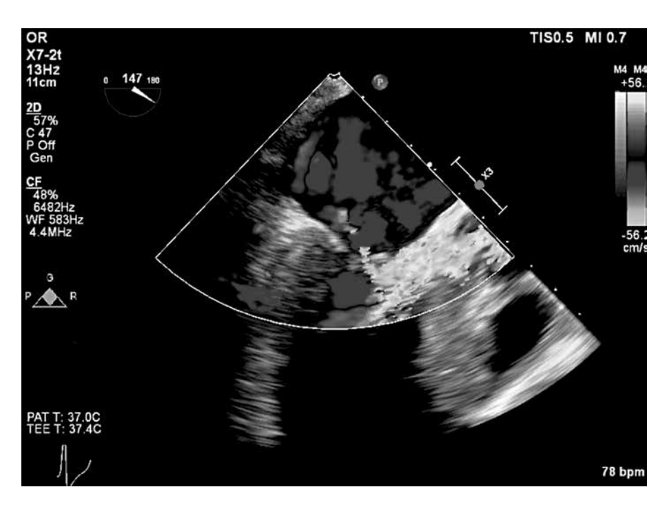
Figure 3. Picture obtained from transesophageal echocardiographic examination after bolus of epinephrine demonstrating worsening of LVOT obstruction with significant turbulence

in blood pressure or ventilation. The adjunctive anaphylaxis medications including 100 mg hydrocortisone, 40 mg of famotidine, and 50 mg of diphenhydramine were administered. Salbutamol was delivered through the ventilator circuit with no improvement in airway pressures or oxygena-