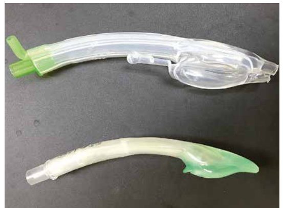
FIGURE 2. Comparison of i-gel and Baska Mask supraglottic airway devices from lateral view; top: Baska Mask, bottom: i-gel

The similarity of these two SGADs are the non-inflatable cuff features, which are considered by some to be the main feature of the so-called third-generation SGADs in comparison to the earlier second-generation SGADs, such as the LMA-Proseal, LMA-Fastrack, etc. There have been very limited studies comparing the igel and Baska mask. Therefore, the aim of this study is to compare the effectiveness of the i-gel and the Baska mask in terms of quality of insertion, quality of ventilation and incidence of post-insertion complications. We hypothesised that the Baska mask as a newer SGAD with non-inflatable cuff is better in terms of quality