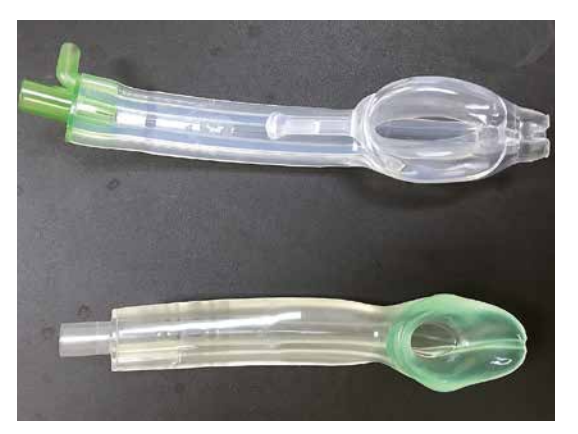
FIGURE 1. Comparison of i-gel and Baska Mask supraglottic airway devices from anterior view; top: Baska Mask, bottom: i-gel

insertion and eliminates the potential for rotation; and the epiglottic rest reduces the possibility of epiglottic 'down folding' and airway obstruction [4, 5].