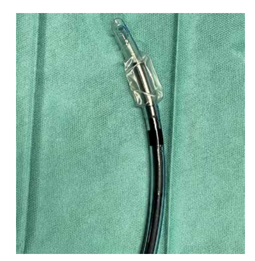
FIGURE 7. Bronchofibroscope with endotracheal intubation tube

is the progressive miniaturisation of equipment that limits the suction power used during operations and removal of the formed clot in narrow airways.