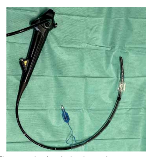
FIGURE 6. Bronchofibroscope with endotracheal intubation tube