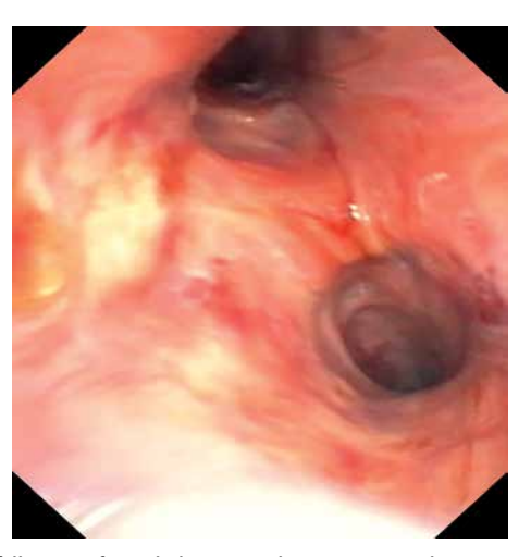
FIGURE 5. Next day follow-up after nebulization with tranexamic acid