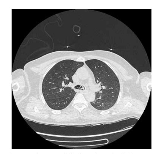
FIGURE 4. Computed tomography scan with the clot in the tracheal bifurcation

dard nebulization kit attached to the ventilator tubing system. Twenty-four hours after initiation of tranexamic acid nebulization, follow-up bronchofibroscopy was performed; it showed a largely healed mucosal surface in the area of the bifurcation of the trachea (Figure 5). No rebleeding or clot