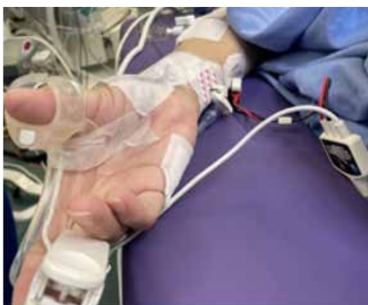
FIGURE 2. Philips Intellivue NMT monitor (Royal Philips Electronics, Amsterdam, The Netherlands)

Datas were obtained from electronic records to build a single, de-identified database. TOFR was measured by either electromyography or acceleromyography using the following monitors: NMT Electron Sensor (GE HealthCare, Chicago, United States; Figure 1) and Philips Intellivue NMT monitor (Royal Philips Electronics, Amsterdam, The Netherlands; Figure 2).