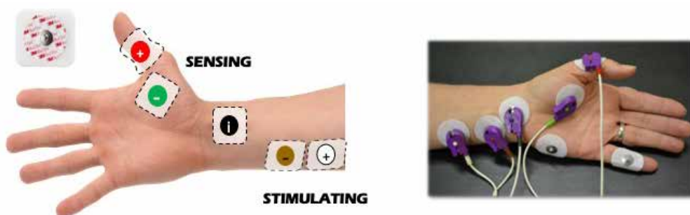
FIGURE 1. NMT Electron Sensor (GE HealthCare, United States)

pharmacological reversal strategy in the PACU and extending the change in care to the operating room (OR).