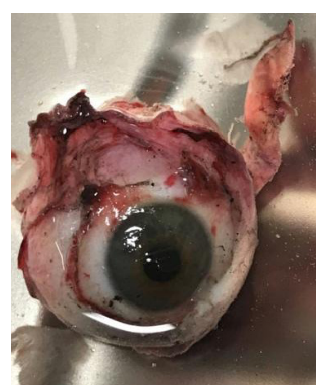
Figure 2. Oedipism: self-enucleated eyeball with about 1.5 cm optic nerve

they have historical and cultural influences that seem to be a kind of catalyst to the act of autoenucleation [9]. The eye is a well-known mystical, religious and sexual symbol in history and across cultures. In literature we can find it as "the gateway to the soul", as symbol of protection from evil but also as evil, reflecting evil-minded thoughts [2, 9].