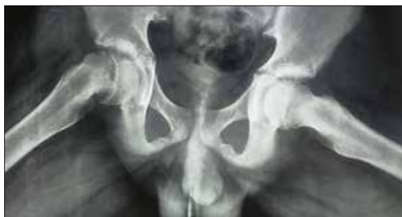
Figure 3. Plain radiograph taken in frog leg position showing a widening of the right proximal physis below the right femoral head with a medial and posterior slip of the right femoral head.