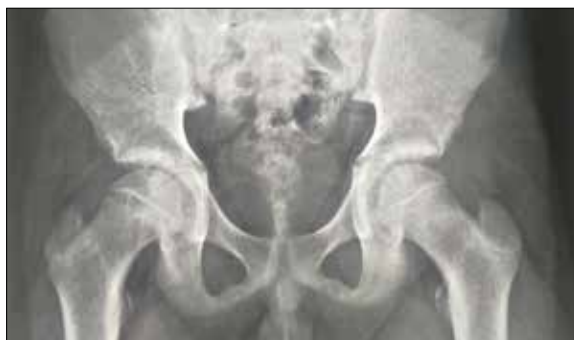
Figure 4. Frontal radiograph of the pelvis taken six months before showing a widening of the proximal right femoral physis.

significant past medical history. Routine laboratory investigations were normal. The patient was referred to the Department of Radio-diagnosis for ultrasound. Ultrasound of both hips was performed with a high frequency transducer (5–9 MHz). A posterior displacement of the femoral head epiphysis with a physeal step was seen on the longitudinal section obtained over the right hip joint region. The anterior physeal step (APS) measured ~3.8 mm on the right side (Figure 1). There was no anterior physeal step on the left side. The distance between the anterior rim of the acetabulum and the metaphysis measured ~20.4 mm on the