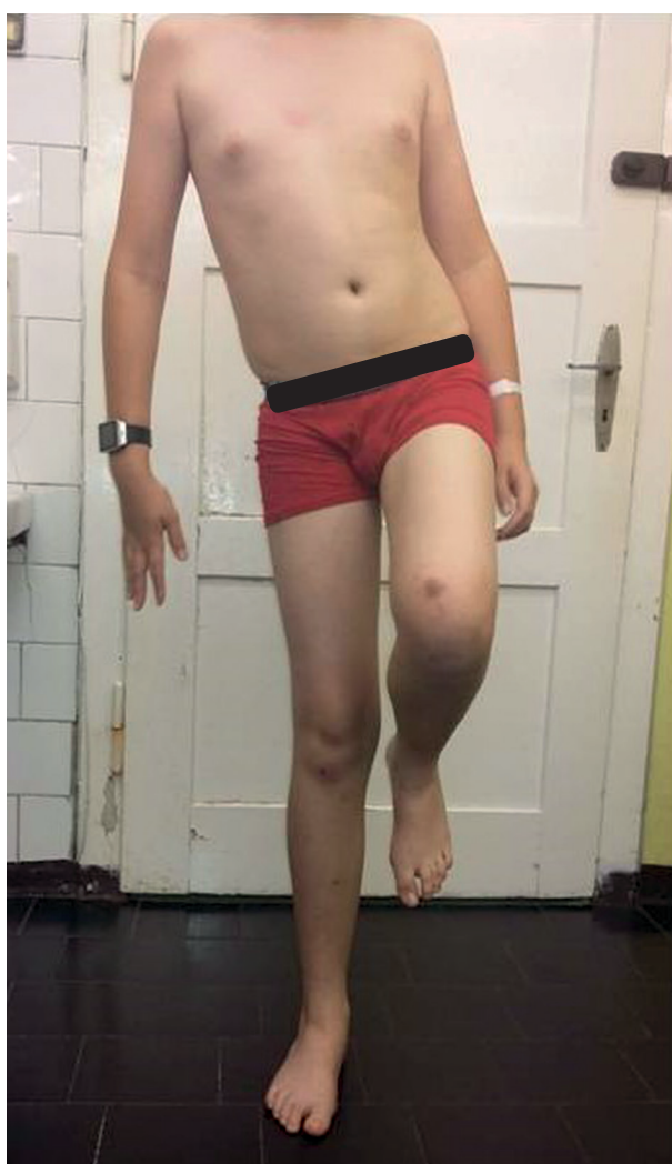
FIGURE 2. Duchenne sign – shifting the upper body towards the stance leg

of neuromuscular disorder were found. The neurologist recommended periodic assessment of CK and reconsultation. Unfortunately, the scheduled gastrological and neurological control visits were irregular and without CK activity assessment.