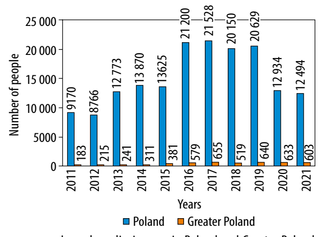
FIGURE 3. Lyme borreliosis cases in Poland and Greater Poland in 2011–2021

Based on the data of the National Institute of Public Health, Department of Epidemiology and Surveillance of Infectious Diseases (2021 – preliminary data).