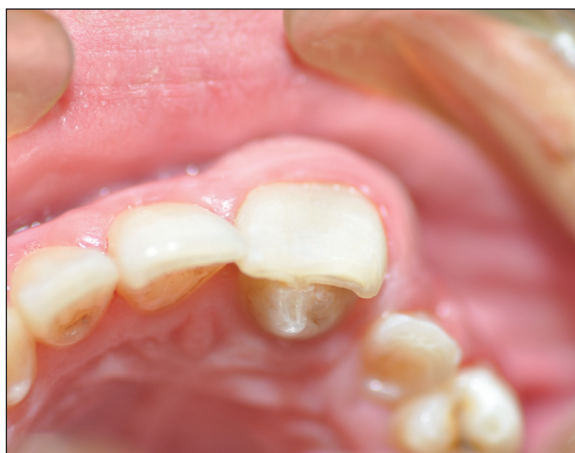
Fig. 2. Intra-oral view.