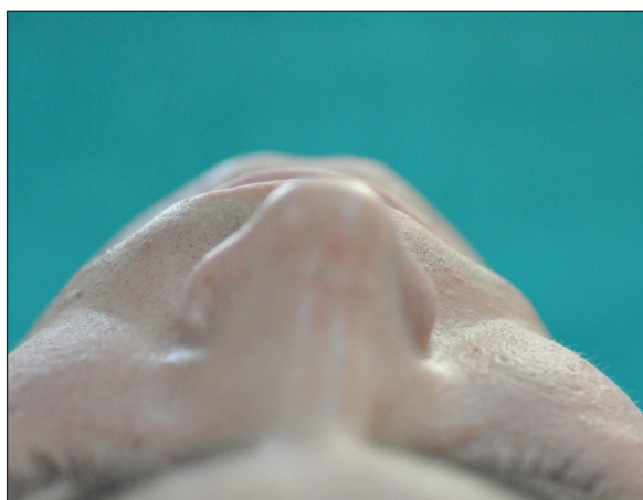
Fig. 1. Extra-oral view of the patient. Please note the asymmetry of the upper lip.