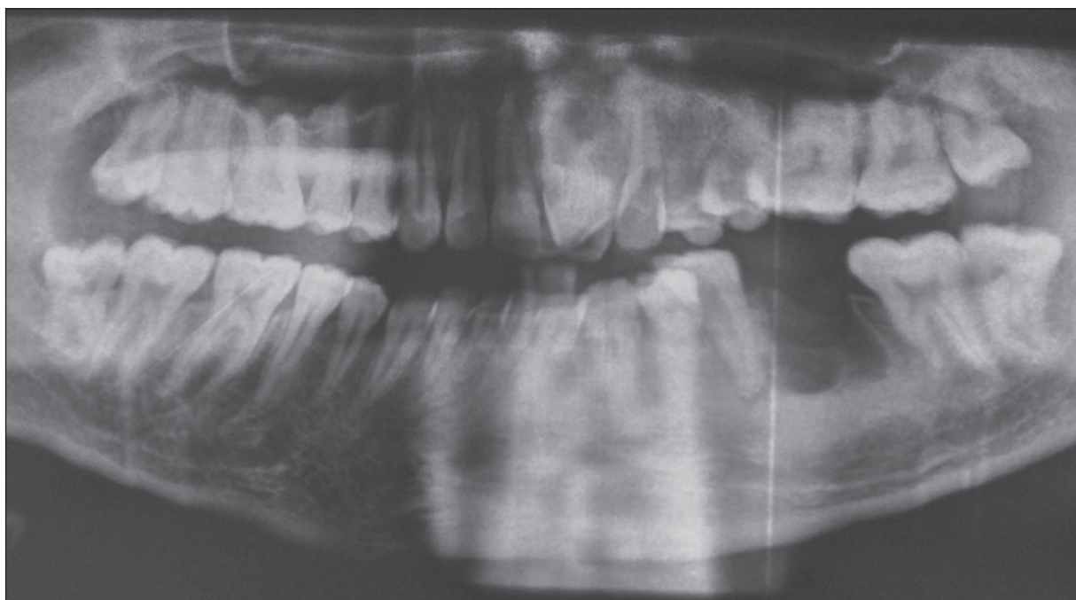
Fig. 3. Orthopantomogram of the patient.

On the extra-oral examination, an asymmetry secondary to a slight bulking on the left side of the upper lip was present (Fig. 1).