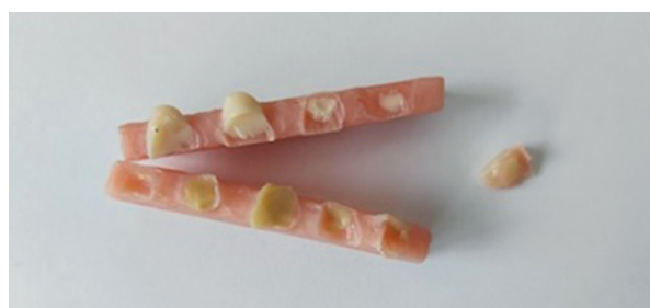
FIGURE 3. Cohesive connection between acrylic teeth (mechanical retention and monomer treatment)