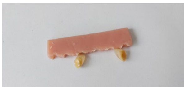
FIGURE 4. Adhesive debonding that occurred in samples with acetone and no treatment group

of tooth surface preparation. However, they were not significant between two investigated groups, i.e., distillate water and Corega Tabs. Teeth adhesion in the group