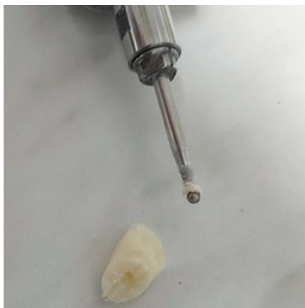
FIGURE 1. Tooth surface prepared with bur with visible retention hole

For each of the groups (1-5), two acrylic plates were made. The first ones were stored in distilled water for