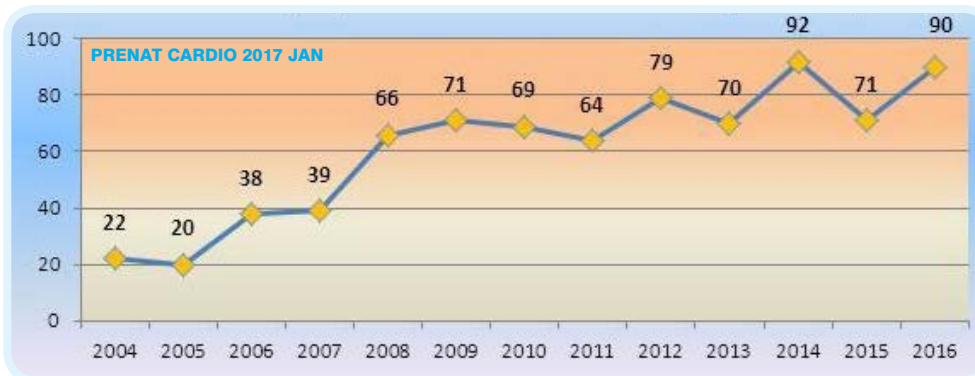
Chart 1. Number of HLHS in Poland in www.orkp.pl in years 2004-2016

In the year 2015 most common karyotype abnormalities were Down