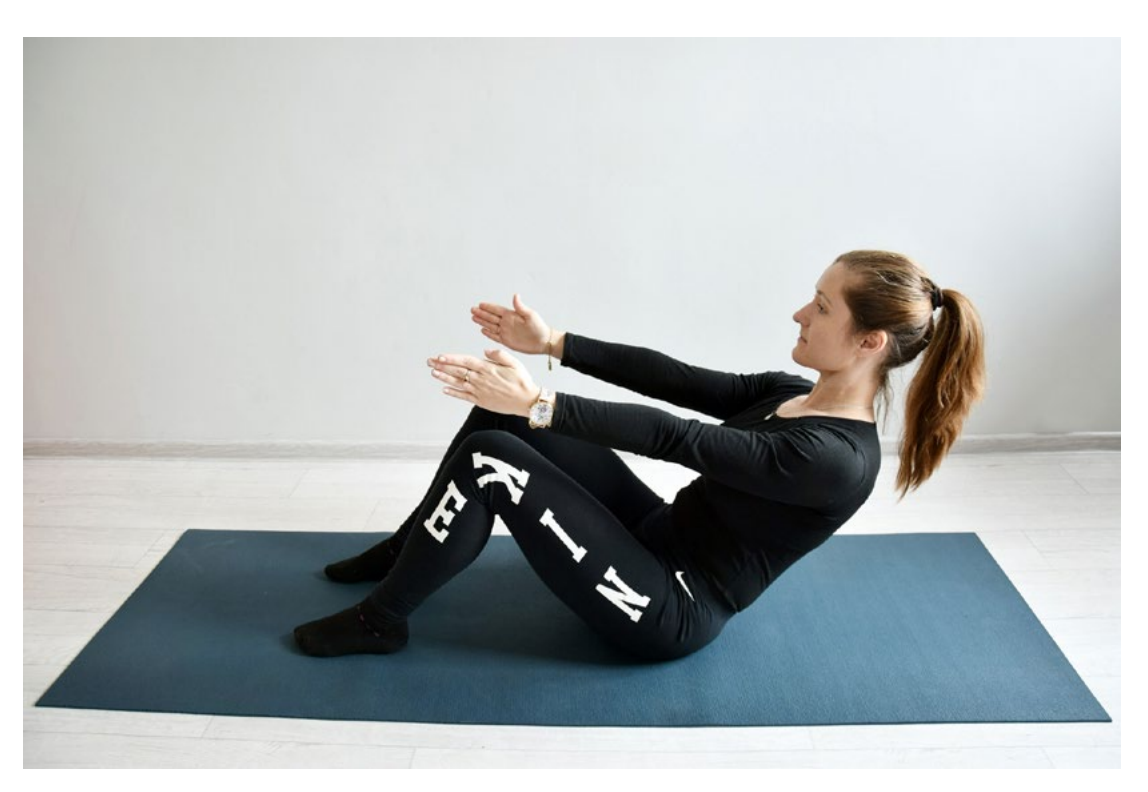
Figure 3b. Roll Down exercise - adequate movement.