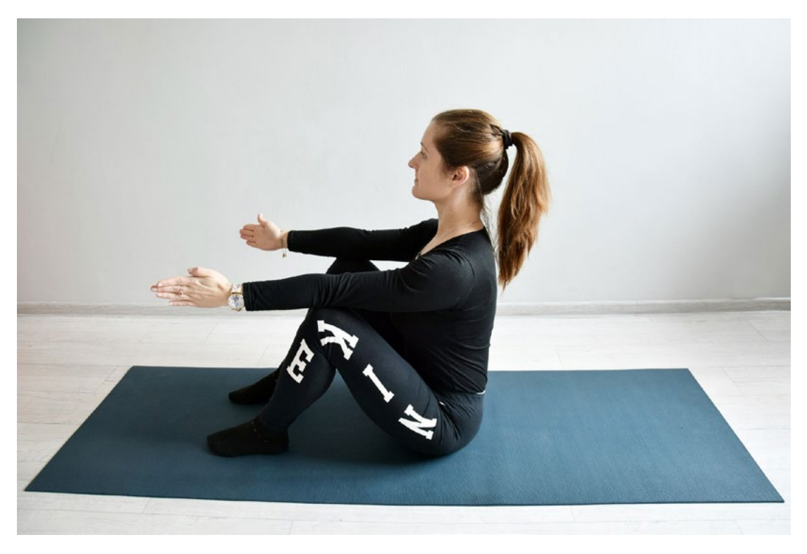
Figure 3a. Roll Down exercise – starting position.