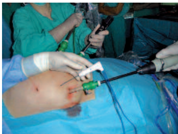
Fig. 1. Operating room setting and intraoperative field during laparoscopic RFA procedure

In all of the four patients the procedure was carried out without any difficulties and the described lesions were located within the liver. In three of the patients all the lesions underwent thermoablation from a single puncture. It turned out that in patient no. 4, who had a single tumour in segment 4b, the lesion was larger than the one described in CT. Its diameter was 45 mm and it comprised the falciform ligament of the liver on one side and the wall of the gallbladder on the other side. First the patient underwent laparoscopic resections of a fragment of the falciform ligament and gallbladder. Thermoablation of the lesion was carried out from three separate punctures. Patient no. 1 had another lesion