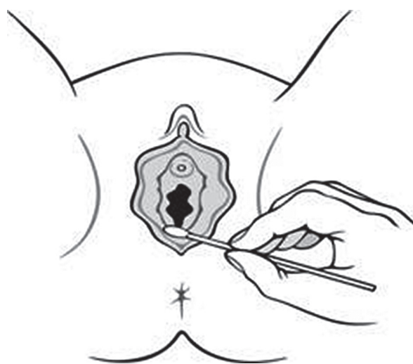
Fig. 2. Cotton swab test