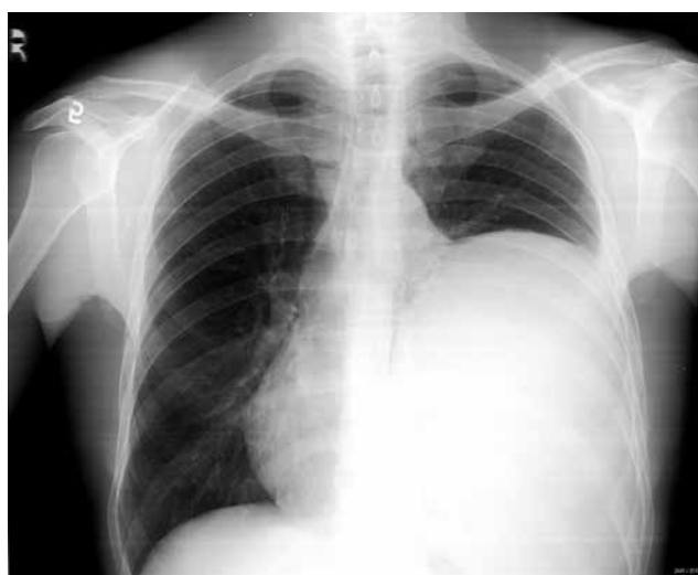
Fig. 2. Chest X-ray of a giant cyst in the non-albendazole group

SD – standard deviation, max. – maximum, min. – minimum