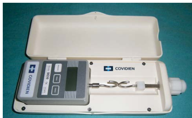
Fig. 1. Photograph of the tensiometer that was used in the study

The values of tensile strength of the cuticular membranes excised in group A were lower than those of the patients in group B, and the difference was statistically significant ( p < 0.001 ) (Table II). The tensile strength values of the perforated cysts were also lower than those of the non-perforated (intact) cysts, and the difference proved to be statistically significant ( p = 0.001 ) (Table III). The ratio of cyst rupture was higher in group A (5/20 in group A vs. 8/29 in group B), but not significantly different ( p = 1 ). The tensile strength of the cuticular membranes did not decrease as the diameter of hydatid cysts increased ( p = 0.069 ).