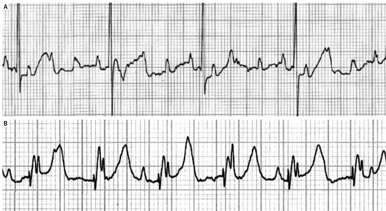
Fig. 1. Preoperative and postoperative electrocardiograms (paper speed 25 mm/s): note the initial complete AV block – HR 54/min (A), and effective epicardial pacing postoperatively – HR 120/min (B)

with compromised cardiac output and circulatory collapse, in a staged strategy [1]. Despite the advancement of contemporary pacing therapies pacemaker implantation in small babies remains a challenge, although the technological progress in generators, leads and programmability enables permanent stimulation in newborns, with spectacular reports of premature low body weight patients treated with artificial stimulation [2].