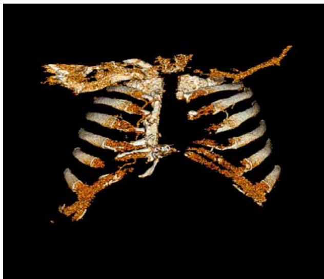
Fig. 1. 3D reconstruction showing sternal dehiscence