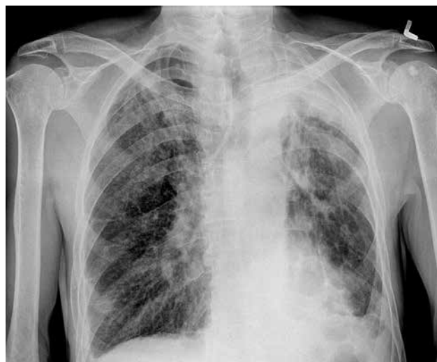
Fig. 4. X-ray of the chest after removal of the drain – normally expanded lungs

Approximately 30 min after the end of the endoscopic examination, the patient reported sudden pain in the right half of the chest, accompanied by dyspnea. Physical examination revealed tachypnea, no alveolar murmur above the right side of the chest, and tympanitic resonance. The obtained chest radiogram visualized right-sided pneumothorax and mediastinal displacement to the left (Fig. 3). During the diagnostic examinations, the patient's condition deteriorated: he lost consciousness, his arterial blood pressure dropped to 50/20 mmHg, and his heart rate slowed to 30 bpm (bradycardia). A drain was immediately inserted into the right pleural cavity, and suction drainage was applied, resulting in swift improvement of the patient's condition. Further radiograms confirmed full expansion of the right lung (Fig. 4). The drain was removed on the 4 th day; on the next day, the patient was discharged home in good general condition.