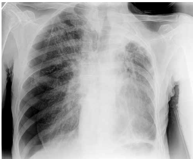
Fig. 3. X-ray of the chest – right-sided tension pneumothorax