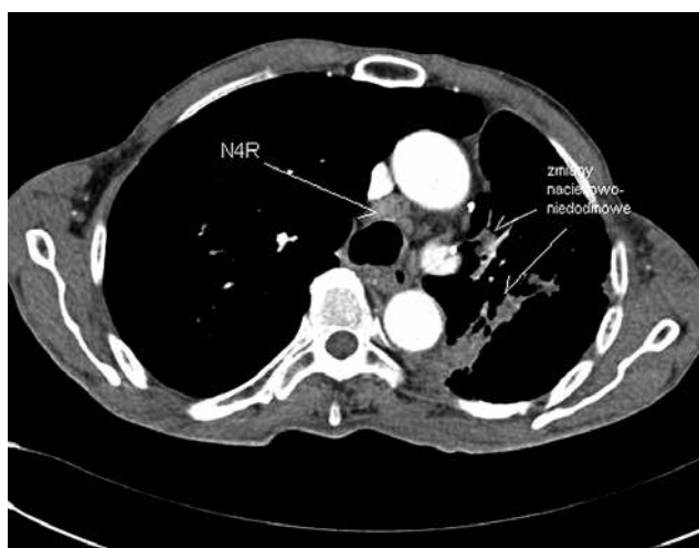
Fig. 1. Chest computed tomography (CT) (mediastinal window) – enlarged mediastinal lymph nodes (N4R) and infiltrative-atelectatic lesions of the left lung and hilum

The 63-year-old male patient with diagnosis of infiltrative lesions of the left lung and hilum as well as mediastinal lymphadenopathy (Fig. 1) and suspicion of hyperplasia