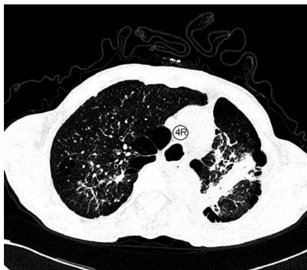
Fig. 5. Chest tomography (pulmonary window) – emphysematous bullae adhering to the mediastinal lymph nodes

Pneumothorax may result from injury of the pulmonary pleura of a previously unchanged lung or from an accidental puncture of an emphysematous bulla during the needle biopsy. In patients with bullous emphysema, this complication may occur as a result of a spontaneous rupture of an emphysematous bulla, caused by an increase of pressure in the chest resulting from strenuous cough during bronchofiberoscopy.