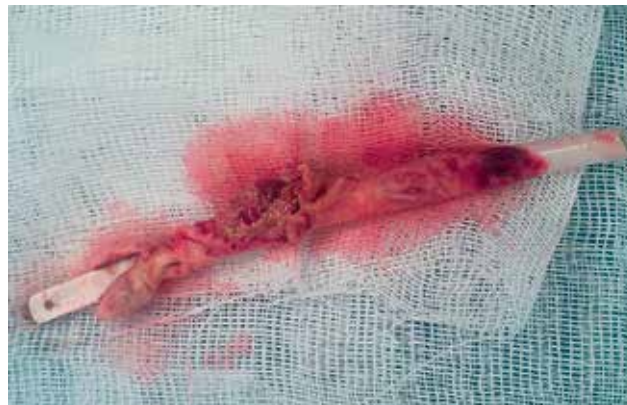
Fig. 1. Fibrous sheath wrapping the distal part of the central venous catheter

moved to the intensive care unit, extubated 5 hours after the operation, and transported to the Cardiovascular Surgery Department on the 3 rd day. A catheter culture that was sent during the operation was sterile, and the pathology report was consistent with infected thrombus. The patient refused the insertion of a permanent catheter again and was discharged with the recommendation of the gastroenter-