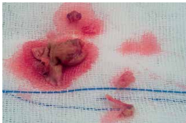
Fig. 3. Mass was removed from distal catheter ending