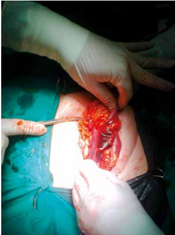
Figure 1. Intraoperative findings